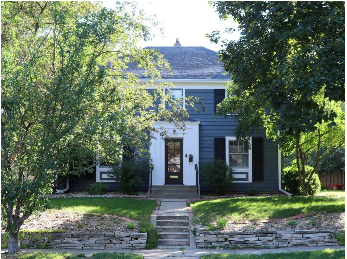
1219 9 th Street, Ames, Iowa