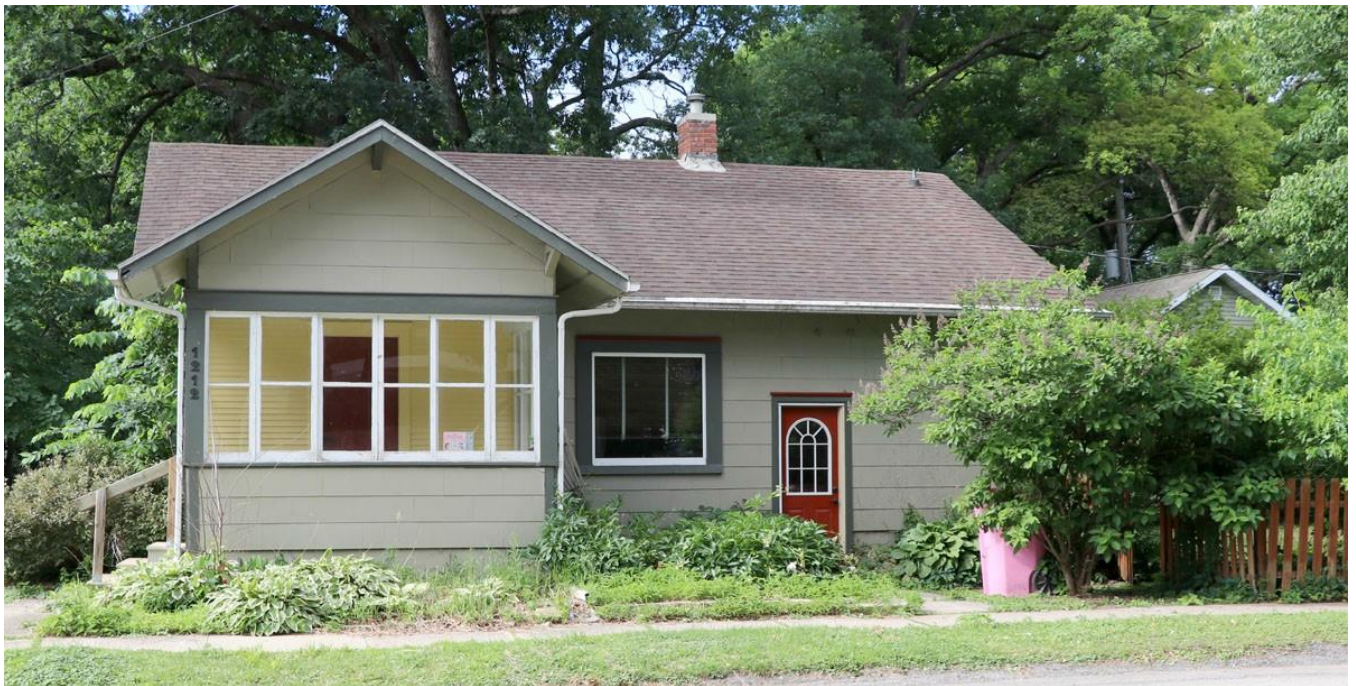
1212 9 th Street, Ames, Iowa

including Craftsman, Colonial Revival, Tudor Revival, and Minimal Traditional; retaining key style characteristics and designs.