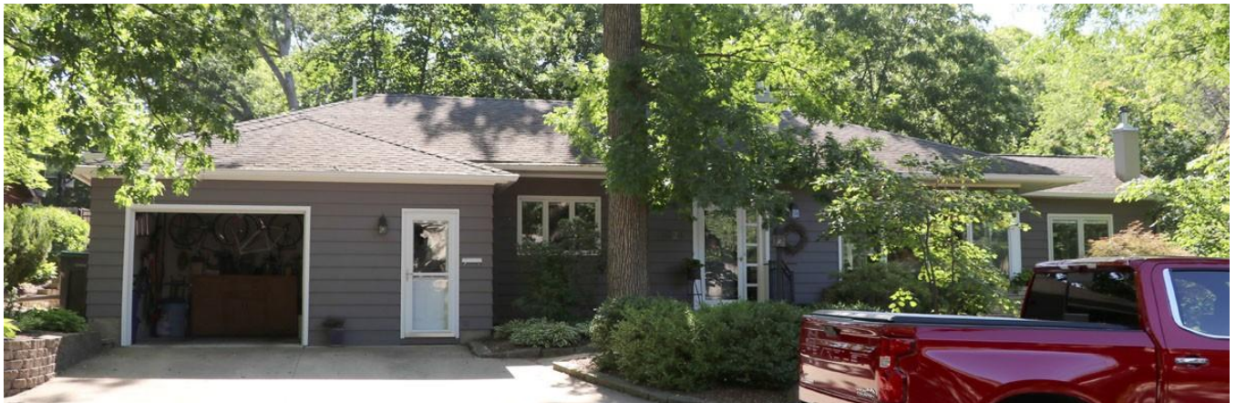
1024 Blackwood Circle, Ames, Iowa

Located on the east side of Blackwood Circle, facing west, this is a one-story Ranch home with a multi-hipped roof and built-in garage. Constructed in 1950 according to Ames City Assessor data and Inspection Division permit files. The foundation material is concrete, and the roof is covered with composition shingle. The home is clad in vinyl. Small concrete porch with steps up to the central door with multipane sidelight on the south side. Set of three casement windows north of door, ribbon of four large fixed-pane windows south of door. Central internal stucco-clad chimney. Secondary stucco-clad chimney on south elevation addition. This home is considered non-contributing because it was not built during the defined period of significance.