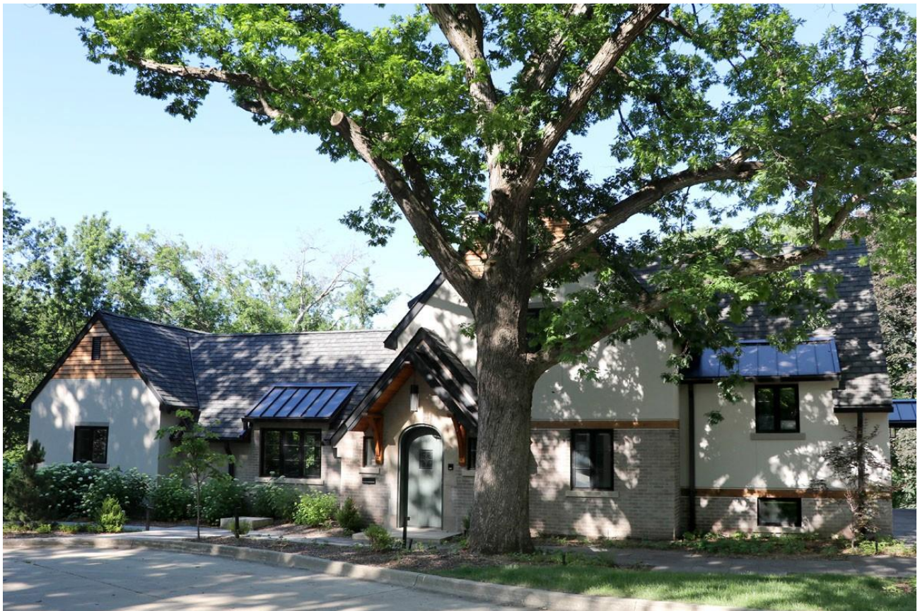
1101 Blackwood Circle, Ames, Iowa

Even though this is not a contributing building, this property is notable for multiple significant and specimen Oak trees. More research and protection for these historic resources is recommended.